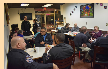
Officers and residents gather at La Cocina de Cuco Jan 16 for Tamales with a Cop.

A week before school started this year, more than 50 kids stopped in for a free back-to-school haircut at the inaugural Cuts with a Cop, a collaborative effort between the Columbia Heights Police Department and Moler Barber School. Officers at the CHPD have been brainstorming creative ways like these to engage with Columbia Heights residents. Recently, the CHPD held “Tamales with a Cop” at La Cocina de Cuco. The variations on the coffee theme will continue March 13 for Chili with a Cop at St Matthew’s Church from 5–7 pm. Keep an eye on columbiaheightsmn.gov for updates.