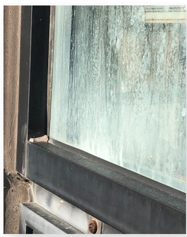
Water intrusion has permanently damaged most building windows.