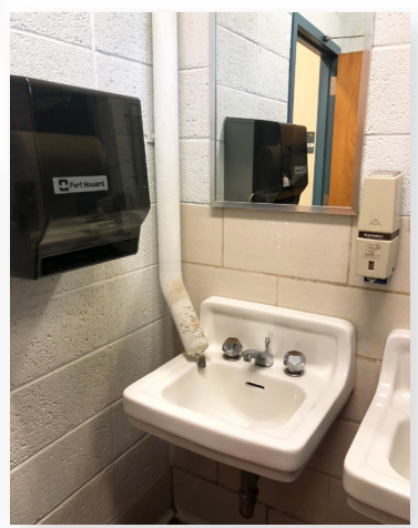
A pipe wrapped in asbestos drains into an employee bathroom sink.