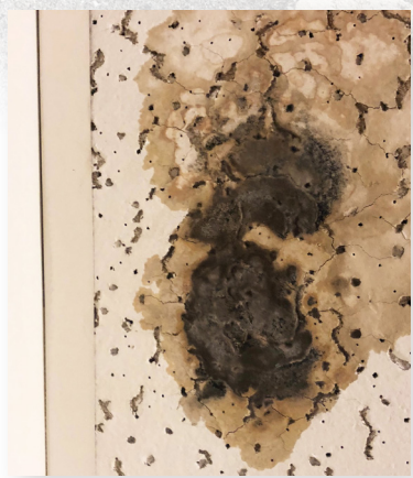
Water damage from roof and wall leakage is prolific throughout the building, in some cases leading to visible mold growth.

City Council and staff are considering options and possible locations for a new City Hall that would be less than half the size of the current City Hall. Keep an eye on the City's website at Columbiaheightsmn.gov for updates on City Hall public feedback events.