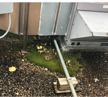
Vegetation grows in standing water on the roof.