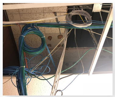
Power, cable, and phone cords hang from the ceiling in the Information Services Department.