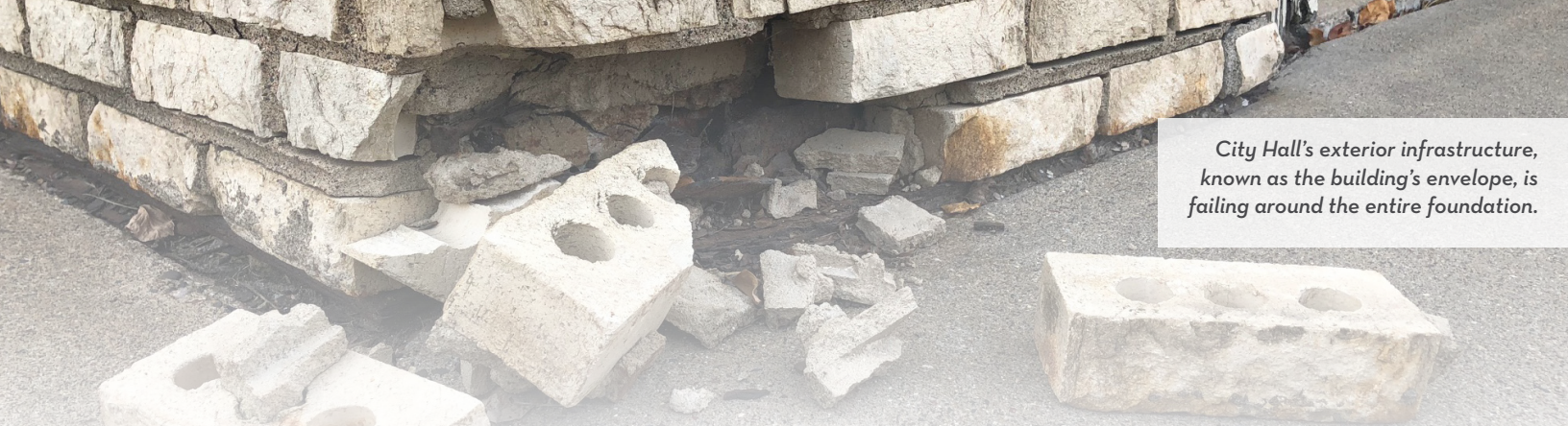
City Hall's exterior infrastructure, known as the building's envelope, is failing around the entire foundation.