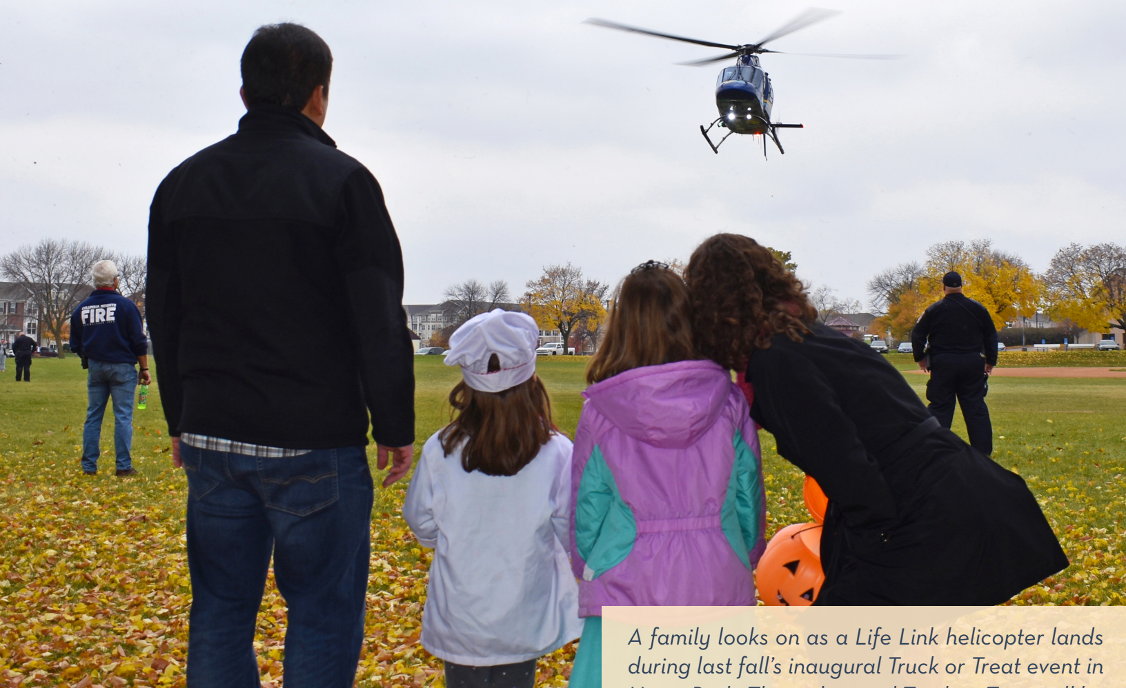
A family looks on as a Life Link helicopter lands during last fall's inaugural Truck or Treat event in Huset Park. The 2nd annual Truck or Treat will be Oct 26. More info on page 3.