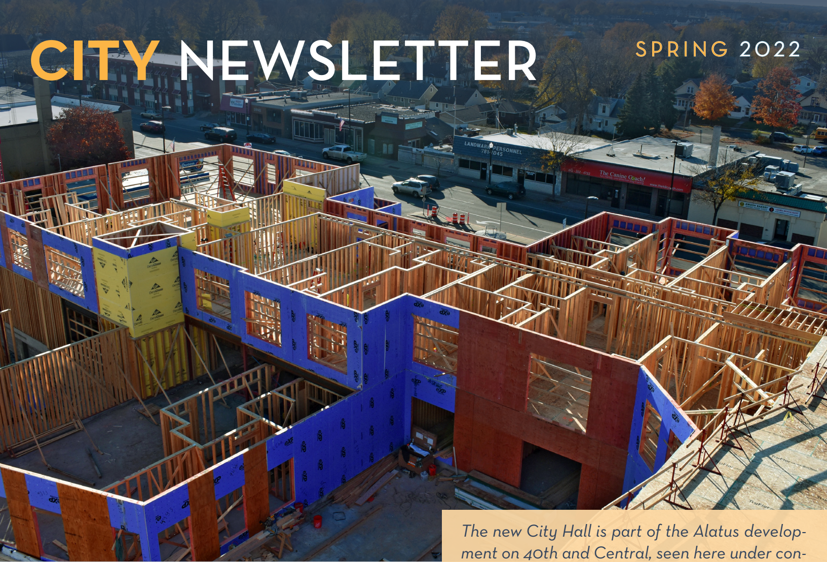
The new City Hall is part of the Alatus development on 40th and Central, seen here under construction, which will also include more than 200 apartment units and a cafe. More on page 6.